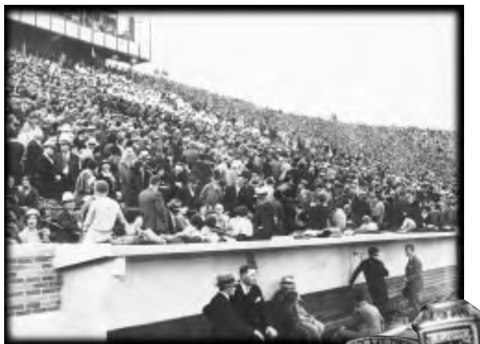
Notre Dame Stadium, 1931.

*Game cancelled because of the death of President John F. Kennedy