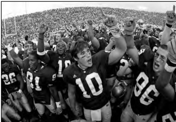
Brady Quinn (#10) celebrates with teammates following a victory over Penn State.